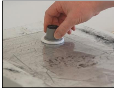
Toner Pad option: 112160-4-9