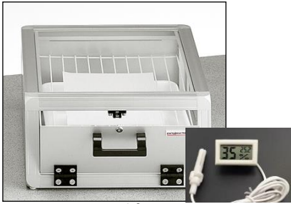
Document Humidifier option: 118258-K-9