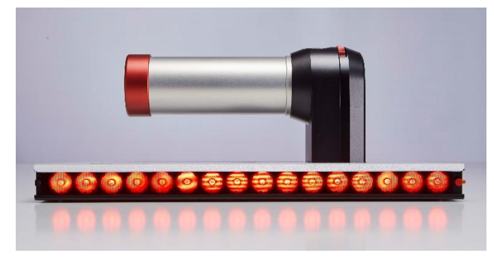
Color filters for contrast enhancement

Designed, developed and manufactured in Switzerland.