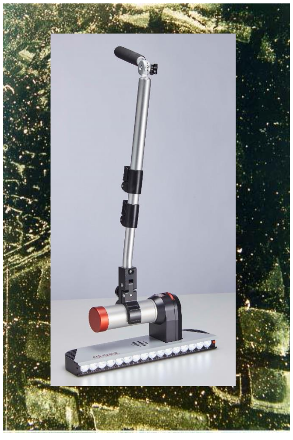
Telescope holder to facilitate evidence search