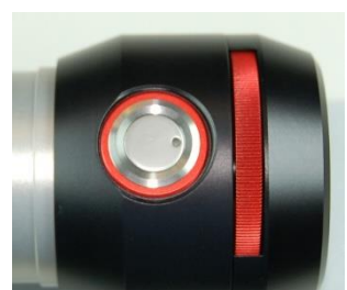
CSL-Shoe power button and dimming wheel