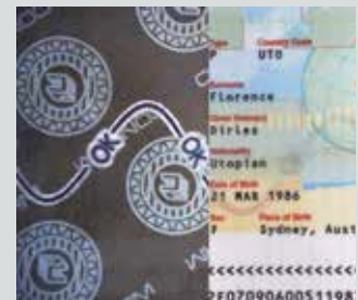
■ Verification of retroreflective security elements