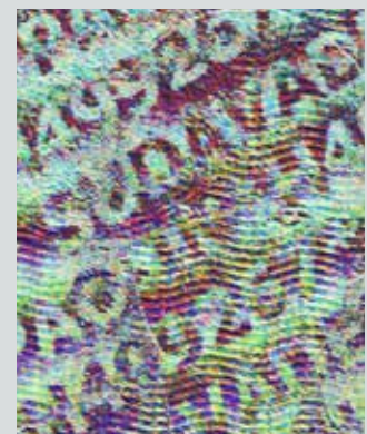
■ IPI (Invisible Personal Information)