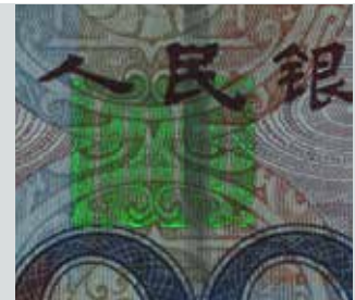
■ IR 740 - 1100 nm illumination for «anti-Stokes inks» examination