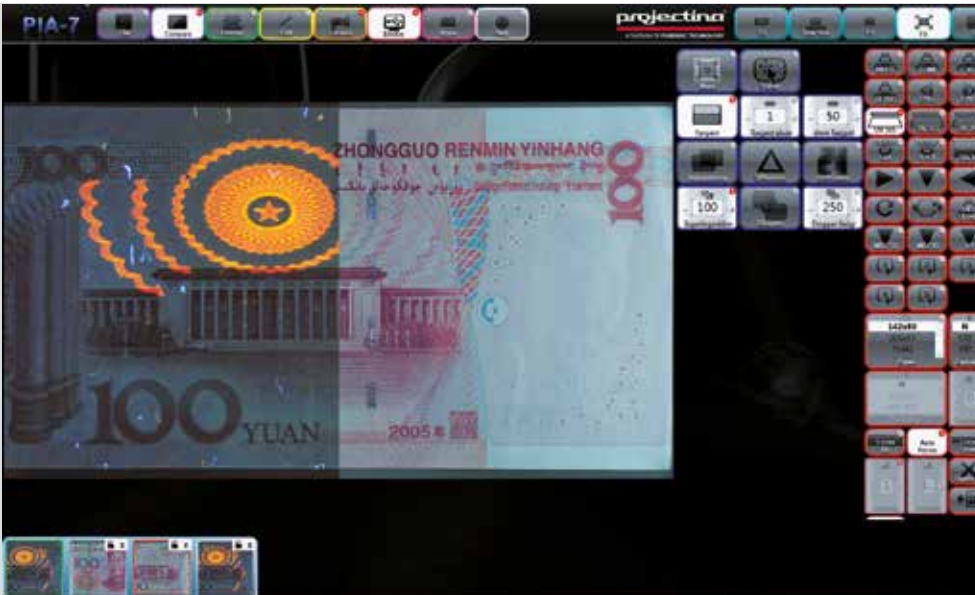
■ Horizontal or vertical split comparisons