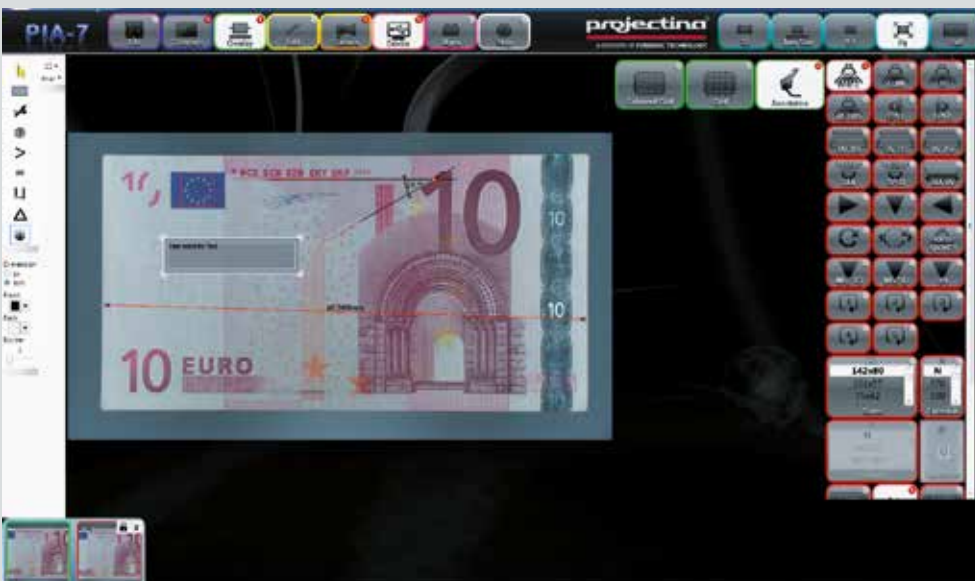
■ Measuring of distances, angles, circle diameters and annotations of text and marks