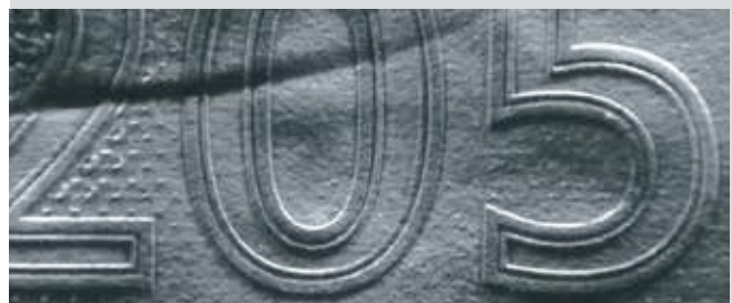
Intaglio printing in IR absorption